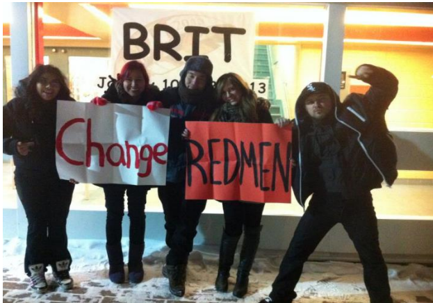
Figure 4: Youth representing the #ChangeRedmen campaign

drummers. However, this was all fuel to the cause and I am glad we made our presence known. This is about resistance, coming together, and overcoming this kind of racist oppression. Props to everyone who came out and also to those who were there in spirit.